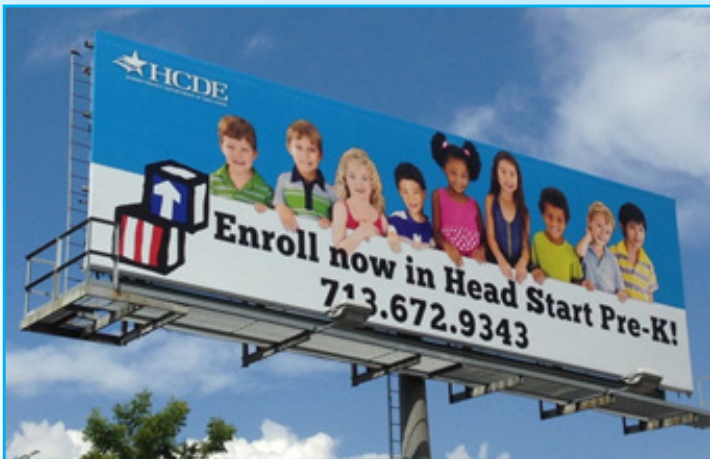
Billboard located on I-10 near Lathrop Road